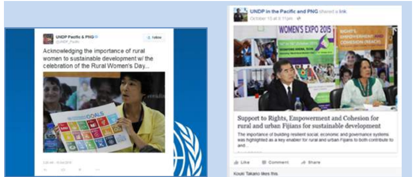
Tweet on 15 October 2015

https://www.flickr.com/photos/undppc/albums/72157657668919523