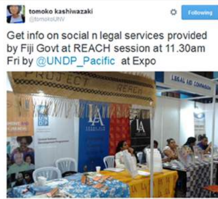
15 Oct 2015 http://bit.ly/1PaMKUL