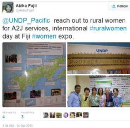
14 Oct 2015 http://bit.ly/1NeGZPG