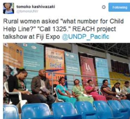
15 Oct 2015 http://bit.ly/1MIDt60