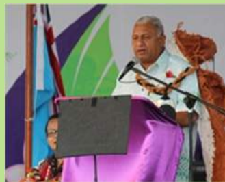
Expo opening by the Prime Minister

Six hundred (600) women from across Fiji (Central, Western, Northern and Eastern Divisions) participated in Expo to showcase their arts and handicrafts and also to commemorate the International Day of Rural Women, 15 October.