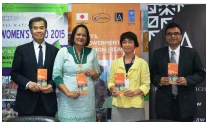
The REACH project supporting the Fiji National Women's Expo

(Suva, Fiji) – The importance of building resilient social, economic and governance systems was highlighted as a key enabler for rural and urban Fijians to both contribute to and benefit from sustainable development by the United Nations Development Programme (UNDP) at the opening of the Fiji National Women's Expo on 14 October.