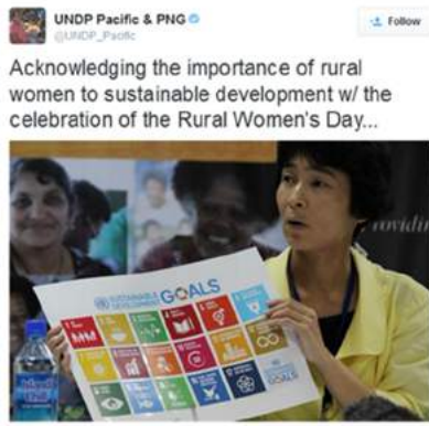
15 Oct 2015 http://bit.ly/1MIDdnD