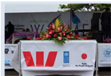
Expo opening stage

Japan's support was visible in various Expo publicity materials: