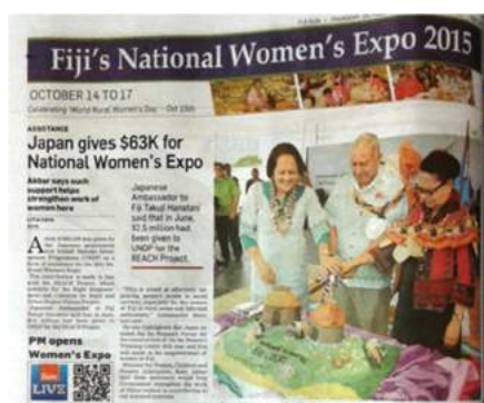
Fiji Sun, Thursday, 15 October 2015

The support given by the Government of Japan through the REACH project and Expo was covered by two major national newspapers, The Fiji Times and Fiji Sun as well as the FBC News on line.