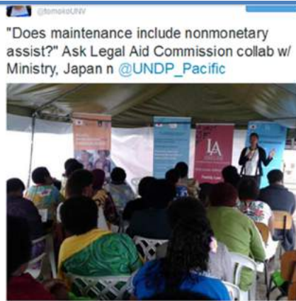
15 Oct 2015 http://bit.ly/1NeGSUu