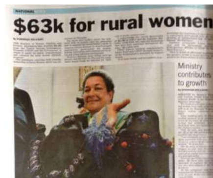
The Fiji Times, Saturday, 17 October

The support given by the Government of Japan through the REACH project and Expo was covered by two major national newspapers, The Fiji Times and Fiji Sun as well as the FBC News on line.