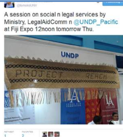
14 Oct 2015 http://bit.ly/1QdBMNi